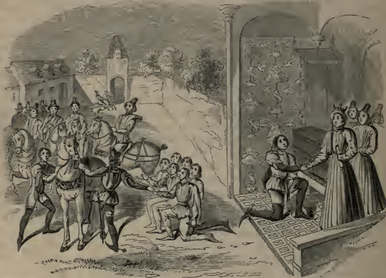
EARL OF DERBY TAKING LEAVE OF THE KING AND LORDS OF FRANCE AT PARIS. FROM MSS. OF THE 15TH CENTURY.

The earl of Derby consented, and came to Paris, where all things were prepared for his departure: he waited on the king as usual whenever he pleased, for the doors of the palace were open to him at all hours. At this last visit, he talked to the king very ably, as he knew well how to do, as to his future plans, and said he would go and amuse himself in Brittany and visit the duke, whom he called his uncle, for he had married a sister to his father, daughter to king Edward. The king, not thinking he was plotting mischief, easily assented: and the earl, having requested an escort to Brittany, the king promised to give instant orders for one to be at his command. To shorten the matter, the earl managed his affairs with much discretion, and took leave of all the lords who were then at court: on his departure, he made very handsome presents to the king's officers, for he was bounden so to do; and to the heralds and minstrels resident in Paris, and who attended the farewell supper he gave at the hôtel de Clisson to such of the French knights as chose to partake of it.